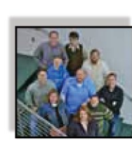
REGION 11: Maestro eLearning