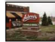
REGION 12: Aubree's Pizzeria and Tavern