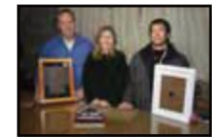
REGION 5: Access Magnetics LLC