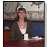
REGION 4: Brenda's Harbor Cafe

Every year, the MI-SBTDC honors 12 outstanding companies chosen from among the many great businesses consulted during the year. This year we had over 15,000 businesses to choose from and now, we are pleased to present these companies with our Best Small Business Award.