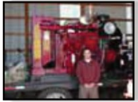
REGION 3: Premium Hydro Solutions LLC