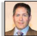
REGION 8: BioPhotonic Solutions Inc.