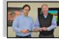
REGION 10: ASI Instruments Inc.