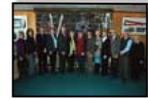
REGION 1: Big Powderhorn Mountain Resort