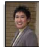
REGION 7: Management Business Solutions Inc.