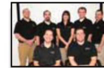
REGION 6: I.N.C. Systems Inc.