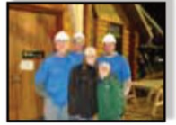
REGION 2: Pine River Inc.